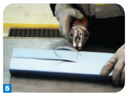
The shear is limited to straight cutting, but can be used for notching or cutting 90° cut-offs on stud or noggin sections.