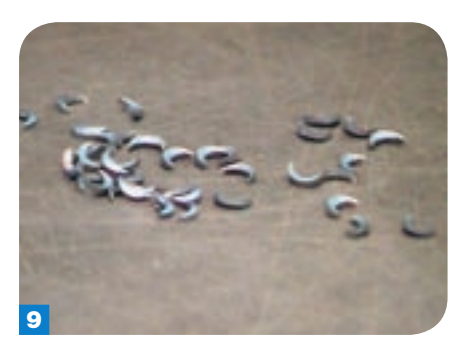
Nibblers produce sharp off-cuts in the shape of half-moons. Please ensure the scrap doesn't fall on the ground or floor as it will be picked up by your shoes.