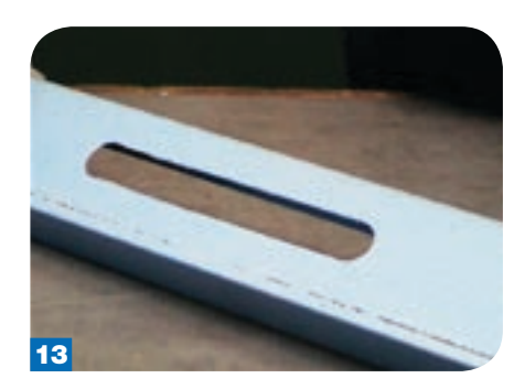
The finished penetration slot, in this example, made by an electric nibbler.