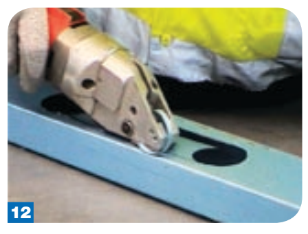
...or electric shear.