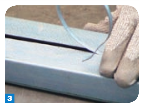
The electric shear operates by cutting-out a continuous strip that leaves the material on either side of the cut undistorted.