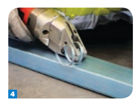
When cutting any straight line, it's best done by measuring the line and marking it out with a ruler, giving you an easy-to-follow guide.