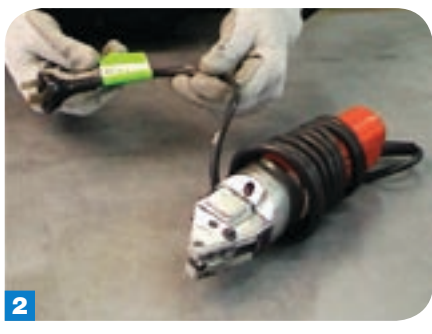
As with all electric tools, ensure safety procedures are followed and that the tool is in good condition and regularly tagged.