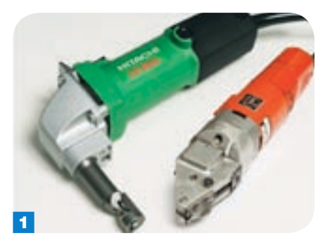
Electric shears and electric nibblers are power tools useful for cutting steel building frames. They provide an alternative cutting method to hand tools such as snips.