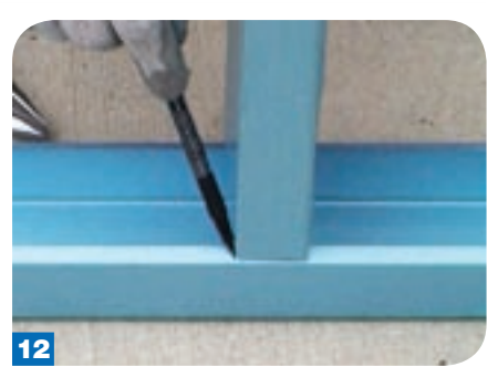
First, mark the location of the stud insert.