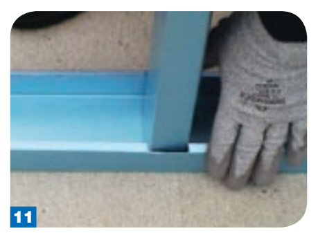
Notching lip C-channel plates. Notching lip C-channel plates to insert a stud can be done easily by using left and right cut snips.