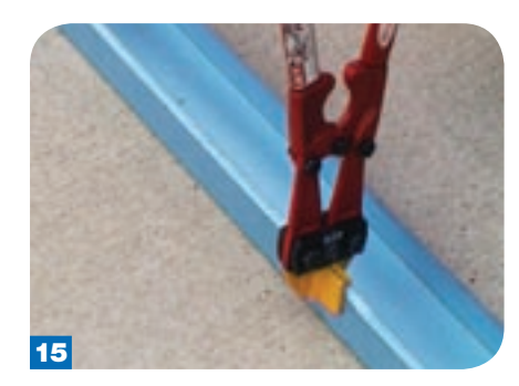
It is a simple tool that is used to flatten the lip as opposed to cutting it out, saving time on the job.