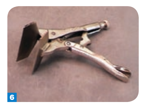
Using a vice grip. A vice grip tool can be used to reduce cutting.