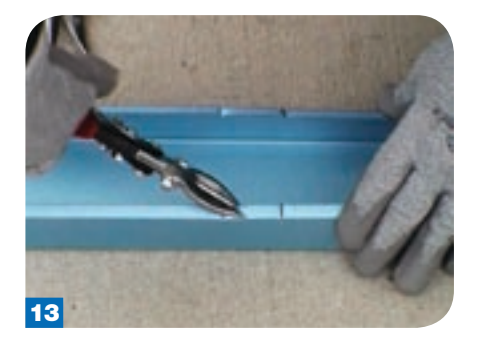
Then use both left and right snips to cut out the material on both lips.